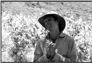
Talkin' grapes at the Summer BDANC meeting

Email simple, unformatted text in the format seen here, to lauraliska@cs.com .