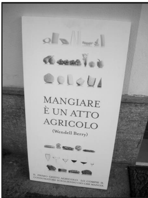
Eating is an agricultural act.