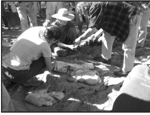
Prep making at the Fall meeting—yarrow, chamomile, and oak bark